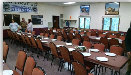
Prep before the banquet