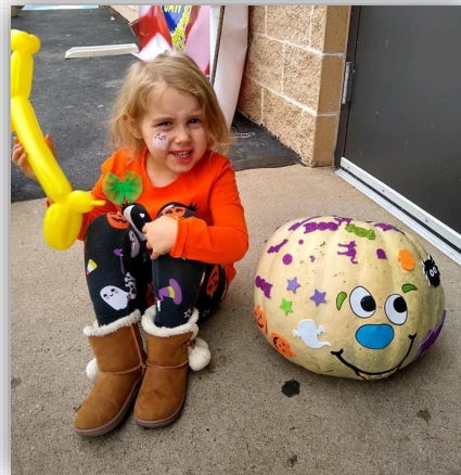
Fun time decorating pumpkins