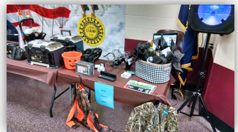
Women's table prizes