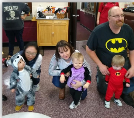
Youngest in costume