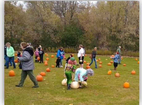
Look at all the pumpkins