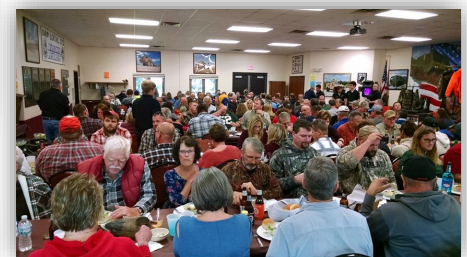
A full house enjoying a meal from The Roxy