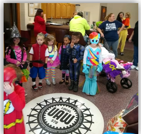
More fun costumes