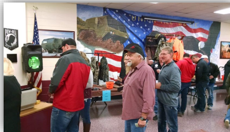
Raffle tickets to buy - hunting table, fishing table, and women's table