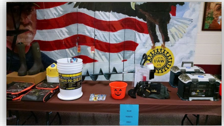
Fishing table prizes