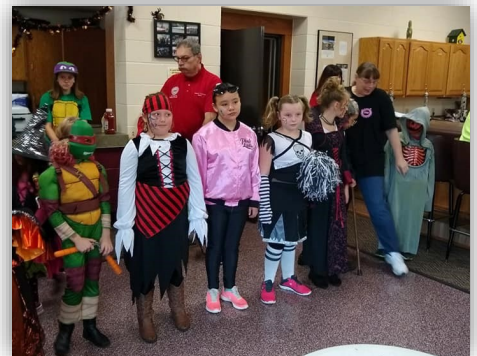
Costumes with the older children