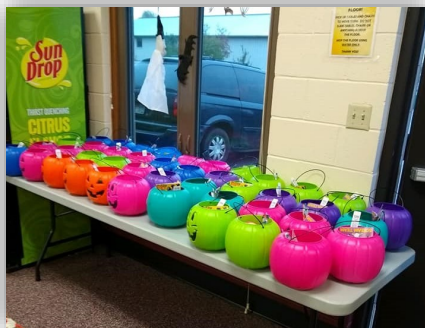
Colored baskets full of treats