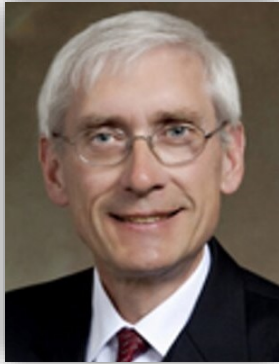
TONY EVERS Candidate for Governor

Dr. Tony Evers was elected State Superintendent of Public Instruction in April 2009. With more than 30 years of public education experience, he has dedicated his life to public education in our state. From 2001 to 2009, Dr. Evers served as Deputy State Superintendent of Public Instruction, working to ensure a quality education for students across Wisconsin and supporting parents and educators. From 1992 to 2000, Tony was the chief administrator of Cooperative Educational Service Agency 6, based in Oshkosh, which serves 42 school districts in east central Wisconsin. On a national level, Tony has been a curriculum auditor in Texas, California, Indiana, Kansas and Ohio. He is also a member of the Council of Chief State School Officers, and was honored by being elected to serve as the national president of the Deputy State Superintendent Leadership Commission by education leaders from all 50 states.